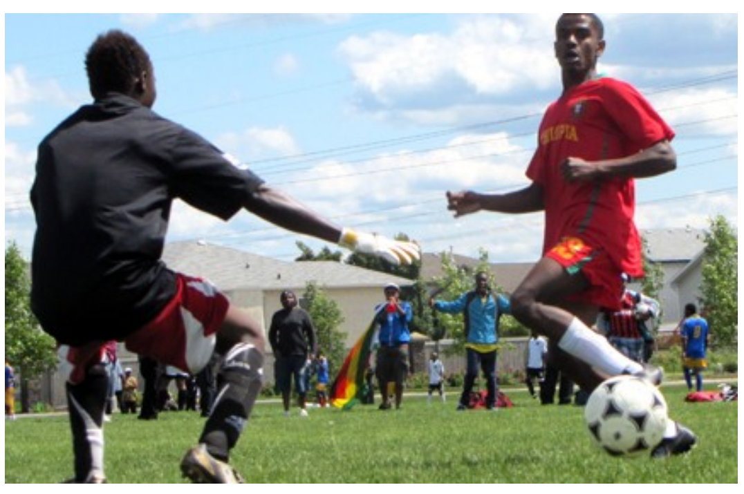
Team Ethiopia in action against Team DR Congo at Poplar Park sports fields.